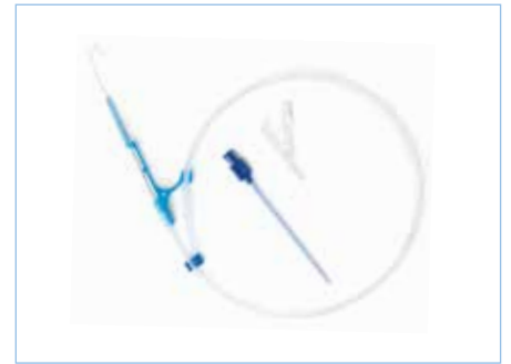
Guidewire, Guidewire advancer, Y-Adaptor, Dilator