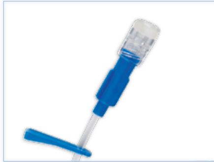
Polyurethane catheter material

Smiths Medical offers a comprehensive range of acute central venous catheters. LOGICATH™ is available in different lengths, outside diameters, lumens and set configurations to meet both healthcare and patient demands.