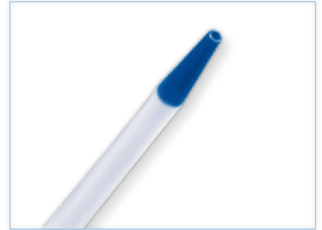
Soft catheter tip