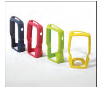
Protective Rubber Gloves