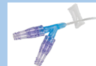
Dual Port with Dual Needleless Connector