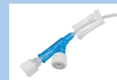
Dual Port with Dual End Caps