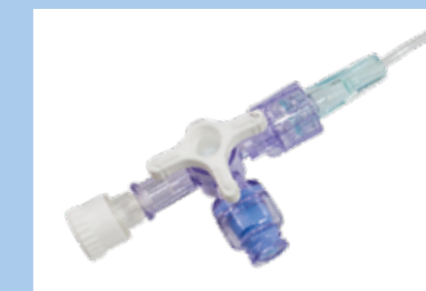
Single Port with Stopcock and Needleless Connector