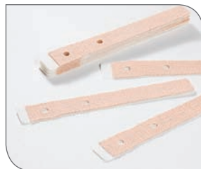
3134, 3135, 3137