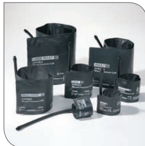
Reusable Blood Pressure Cuffs