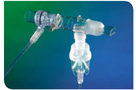
EzPAP® may be used in conjunction with aerosol medication (e.g. nebulizer) via 22 mm connection between EzPAP® and patient.

The EzPAP® Positive Airway Pressure System includes the EzPAP® lung expansion device, mouthpiece, pressure port cap, and 7 feet of tubing. Three mask options are also available.