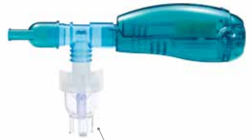
Proximal placement of nebulizer on the acapella® device.

acapella® duet and acapella® choice vibratory PEP products are easily disassembled and reassembled for effortless cleaning.