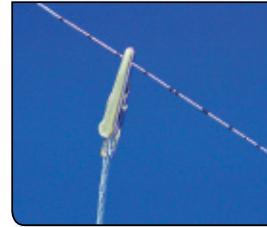
DuraFlex® Plus Wire reinforced catheters with a stiffer base to prevent coiling and promote easy threading