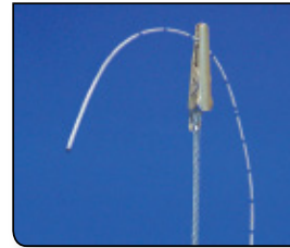
DuraFlex® Wire reinforced catheters with reduced stiffness

For clinicians who use wire reinforced catheters, DuraFlex® and DuraFlex® Plus catheters provide a choice in catheter softness and tip geometries. Multiple catheter styles ensure that you can perform procedures with the catheter you prefer.