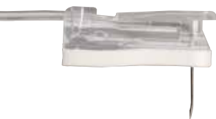
GRIPPER PLUS® Safety Huber Needles