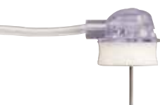
GRIPPER® Micro Blunt Cannula Safety Needles