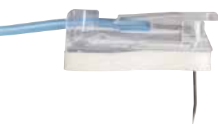
GRIPPER PLUS® POWER P.A.C. Safety Huber Needles