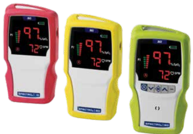
SPECTRO 2 ® Pulse Oximeters

Rates the relative probability that the patient may suffer from sleep-disordered breathing and require further testing in the sleep lab.