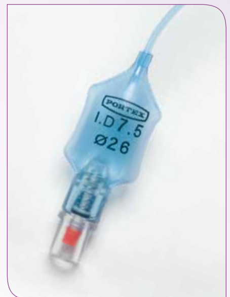
Printed pilot balloon