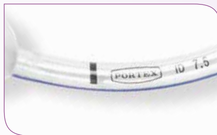
Intubation depth marker