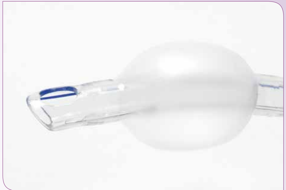
Low pressure high volume cuff