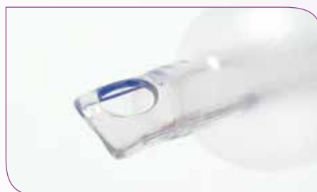
Smooth Murphy eye