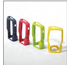
Protective Rubber Gloves