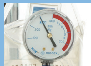
Large Pressure Gauge