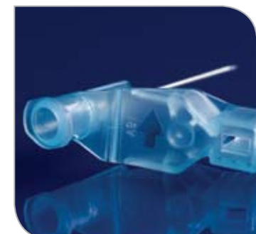
Molded arrow points in direction of bevel.