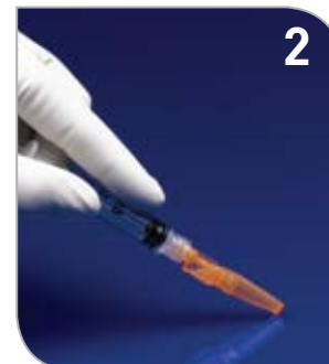
Close safety device on any flat surface