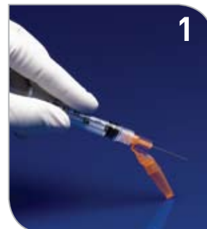
Perform a one-handed technique