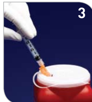
Discard in sharps container

With the Needle-Pro ® EDGE ™ Safety Device, you can make injections more convenient with a pre-attached syringe.