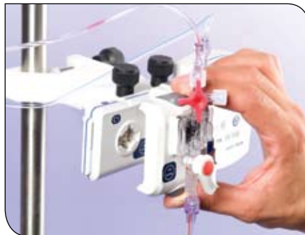
Compatible with LogiCal ® disposables