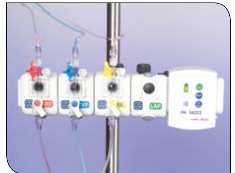
Quadruple sender with 3 disposables