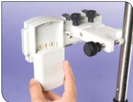
Rechargeable batteries provide uninterrupted service