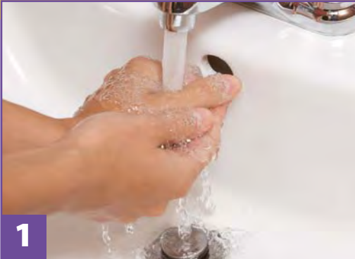
1 Wash hands, dry thoroughly.