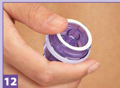
12 Verify needle retracted. If still visible, press down on outer edge until needle retracts fully.