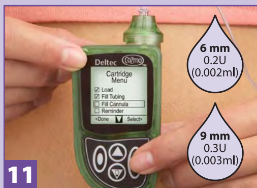
11 Fill cannula with medication. (U100 insulin)