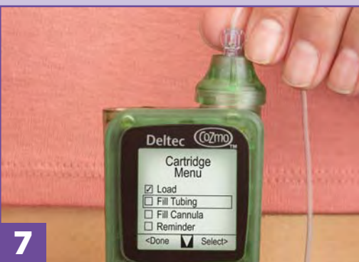
7 Connect the tubing set and fill according to the pump User Manual.