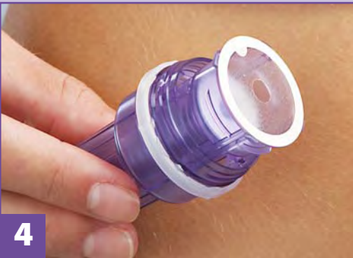
4 Inspect device for adhesive and insertion needle.