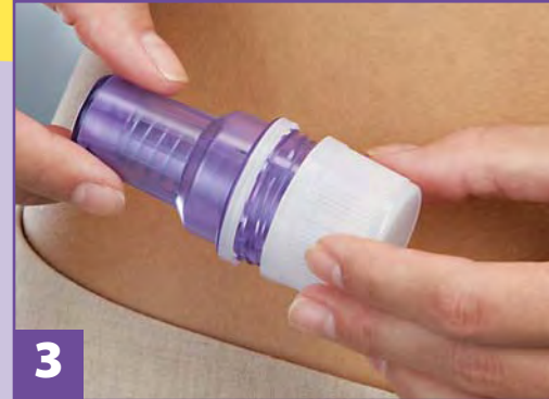
3 Twist cap to remove.