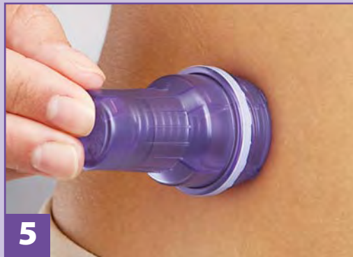
5 Press device firmly on site. Hold for 5 seconds, pull straight off.