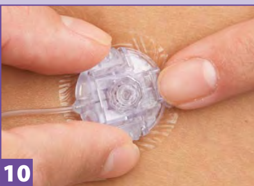
10 Secure connector over site, push together until audible "click."