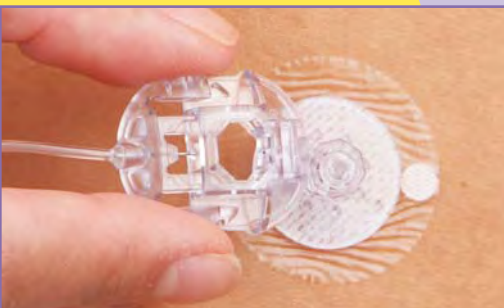
Pinch connector arms to open. Lift off site.