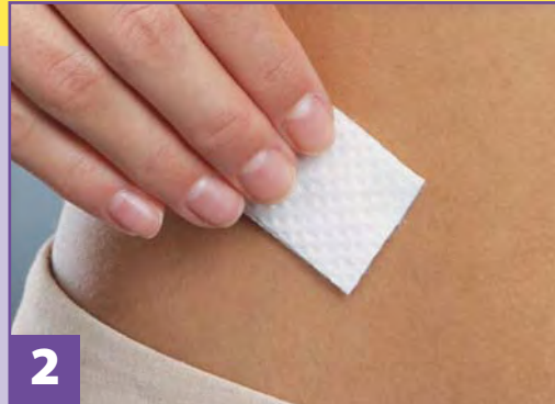
2 Prepare site, allow to dry.