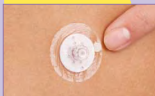
Press finger near peel dot. Peel back adhesive.