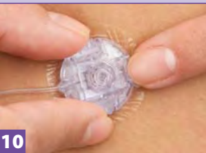
10 Secure connector over site, push together until audible "click."