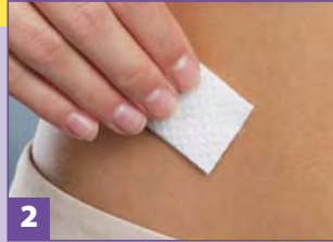
2 Prepare site, allow to dry.