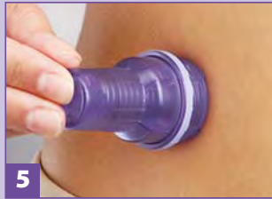
5 Press device firmly on site. Hold for 5 seconds, pull straight off.