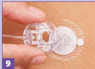
9 Position site connector onto site with tubing in desired direction.