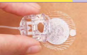
Pinch connector arms to open. Lift off site.