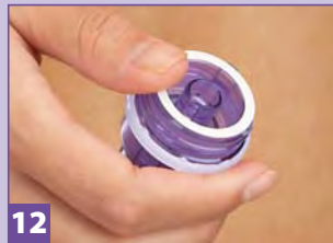
12 Verify needle retracted. If still visible, press down on outer edge until needle retracts fully.