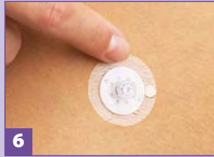
6 Press to secure adhesive.