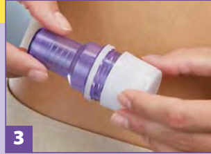
3 Twist cap to remove.