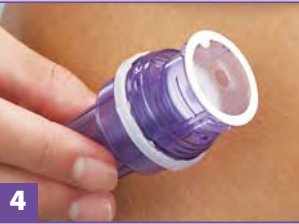
4 Inspect device for adhesive and insertion needle.