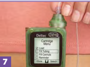
7 Connect the tubing set and fill according to the pump User Manual.