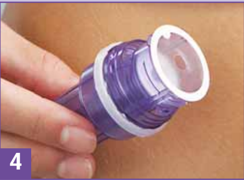
4 Inspect device for adhesive and insertion needle.