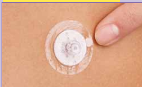
Press finger near peel dot. Peel back adhesive.