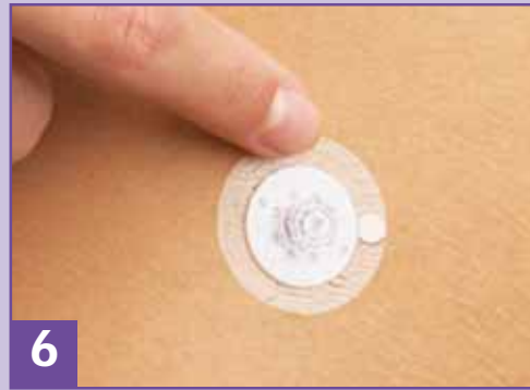
6 Press to secure adhesive.