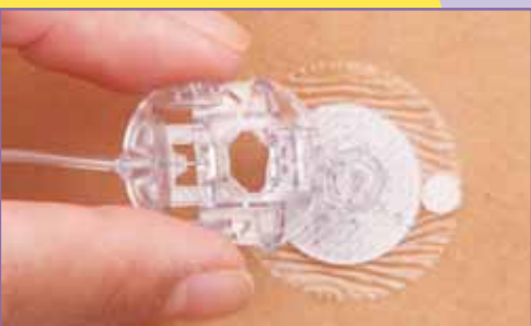
Pinch connector arms to open. Lift off site.