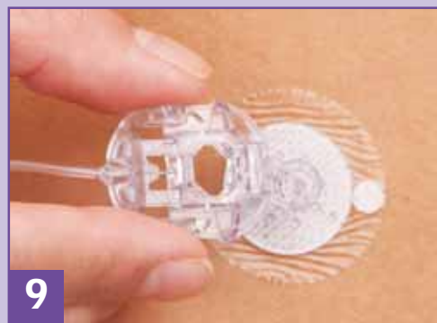
9 Position site connector onto site with tubing in desired direction.