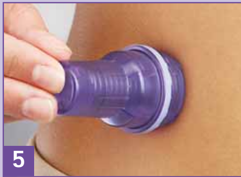
5 Press device firmly on site. Hold for 5 seconds, pull straight off.