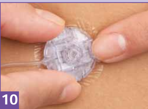
10 Secure connector over site, push together until audible "click."