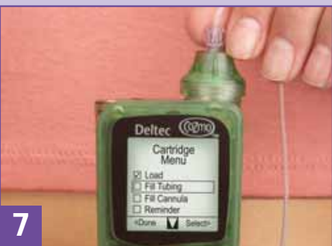
7 Connect the tubing set and fill according to the pump User Manual.