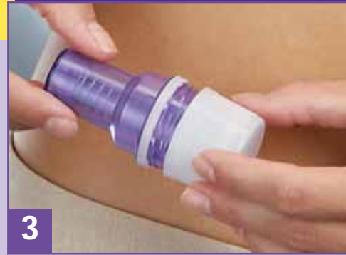
3 Twist cap to remove.