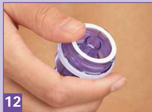
12 Verify needle retracted. If still visible, press down on outer edge until needle retracts fully.