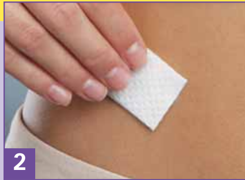
2 Prepare site, allow to dry.