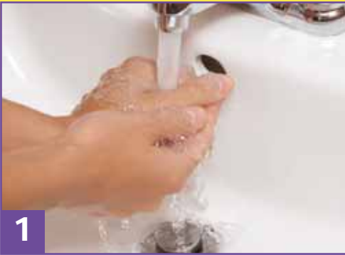
1 Wash hands, dry thoroughly.