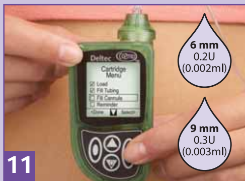
11 Fill cannula with medication. (U100 insulin)