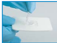
Open LockIt Plus™ securement device