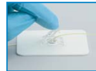
Close device to secure catheter