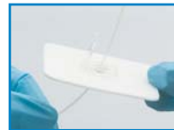
Insert catheter through device