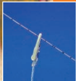
DuraFlex™ Plus catheter

choices without compromise in wire reinforced catheters