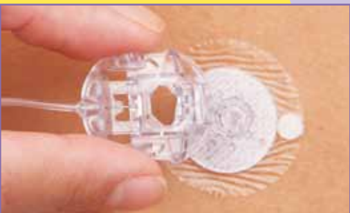
Pinch connector arms to open. Lift off site.