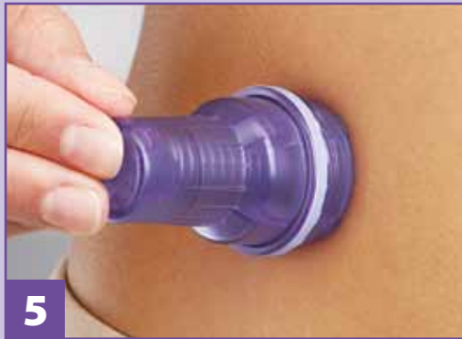
5 Press device firmly on site. Hold for 5 seconds, pull straight off.