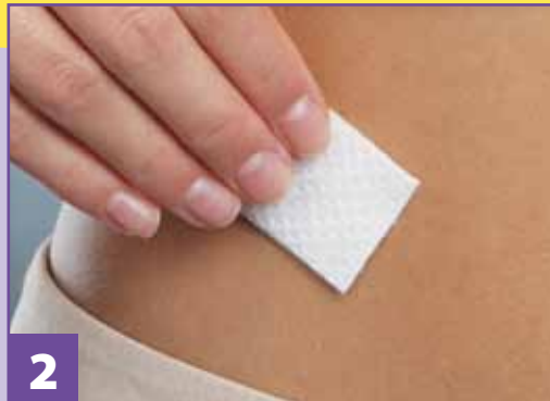
2 Prepare site, allow to dry.