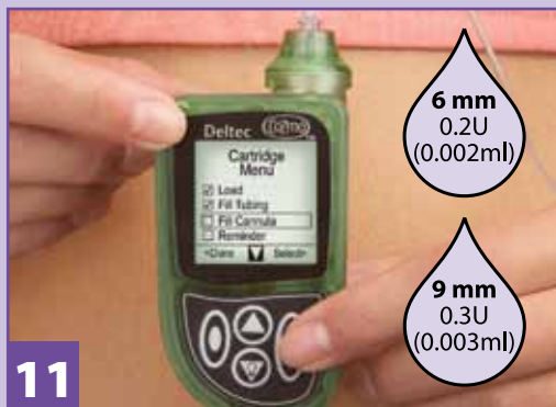
11 Fill cannula with medication. (U100 insulin)