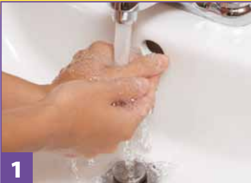
1 Wash hands, dry thoroughly.