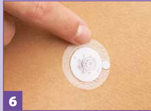
6 Press to secure adhesive.