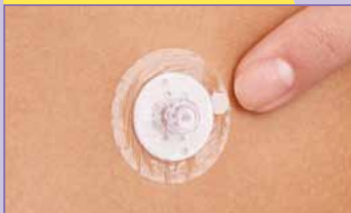
Press finger near peel dot. Peel back adhesive.