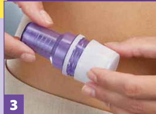
3 Twist cap to remove.