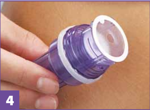
4 Inspect device for adhesive and insertion needle.