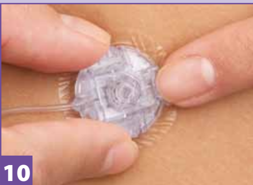
10 Secure connector over site, push together until audible "click."