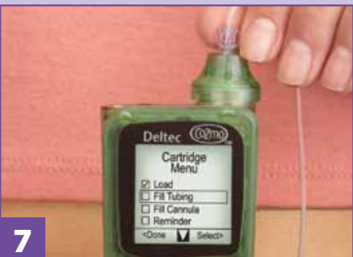
7 Connect the tubing set and fill according to the pump User Manual.