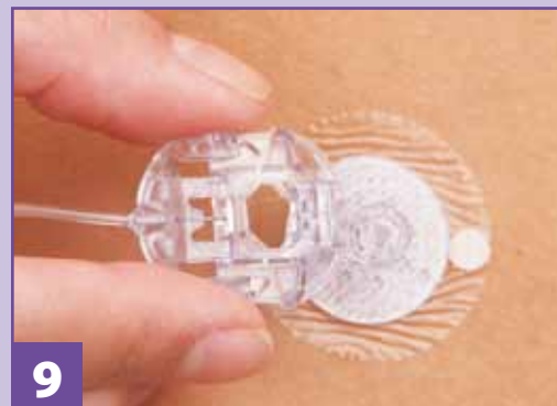
9 Position site connector onto site with tubing in desired direction.