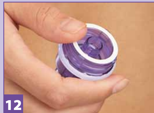
12 Verify needle retracted. If still visible, press down on outer edge until needle retracts fully.