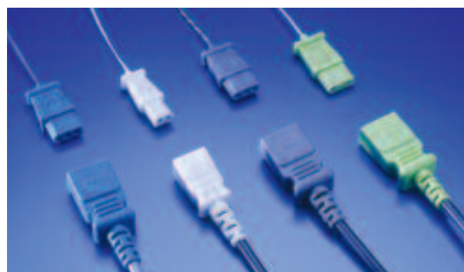
The color-coded, keyed and insert-molded connections are designed for a sure fit every time.

Temperature monitoring, especially in the operating room and during general anesthesia, is a crucial aspect of patient care. Smiths Medical temperature probes are superior in their manufacture and design, providing reliability, durability, and accuracy. The connection is the key.