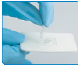
Open LockIt Plus® securement device